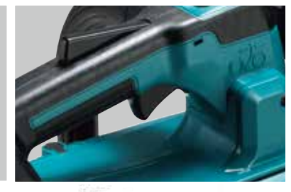
Variable speed trigger switch